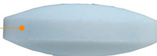
MAGENETIC STIR BAR