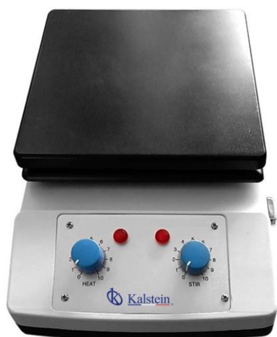
Analog Ceramic Hotplate Magnetic Stirrer Serie YR02933