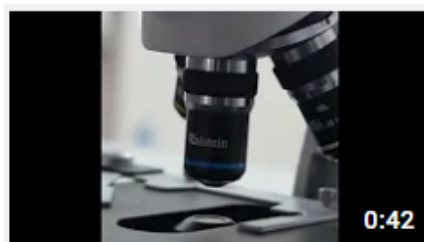
Kalstein's Microscopes 445 views • 1 week ago