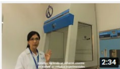
Kalstein France - Jacinto Convit Foundation / Alliances 23 views • 3 years ago