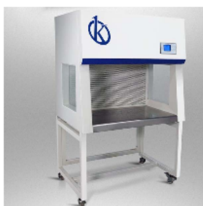
Single Person Laminar Flow Cabinet YR05266