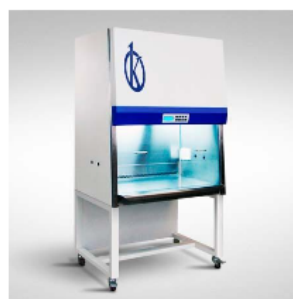
Biological Safety Cabinet YR05270 - YR05271