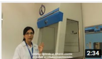
Kalstein France - Jacinto Convit Foundation / Allianc...