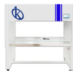
Laminar Flow Cabinet YR05740