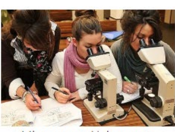
Microscope: Halogen vs. Illumination leds