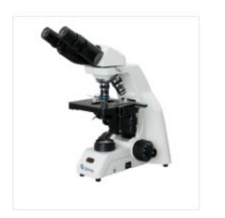
Laboratory Microscope YR0239 - YR0240

Inverted Fluorescent LED Microscope YR057!