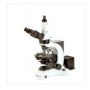
YR0261 Polarizing Microscope