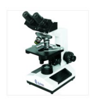
Binocular Biological Microscope for Students