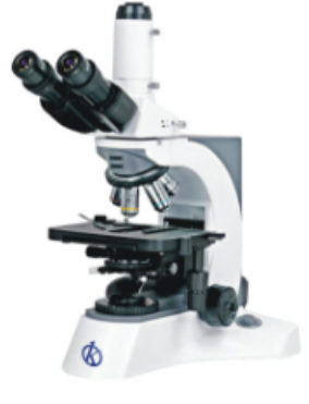
Trinocular microscope YR0231 With front and low position coaxial focus system, focus knobs and brightness adjustable knob inside...