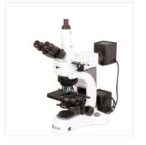
Metallurgical microscope YR0255