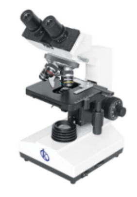
Binocular microscope YR0242 With precision machining equipment and improving the bottom of the traditional microscope YR0242. Is a...