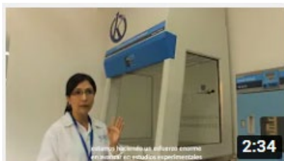
Kalstein France - Jacinto Convit Foundation / Alliances 23 views • 3 years ago