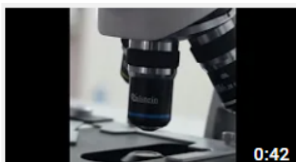
Kalstein's Microscopes 445 views • 1 week ago