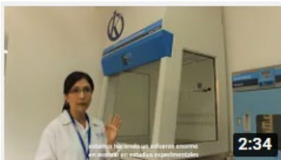
Kalstein France - Jacinto Convit Foundation / Allianc...