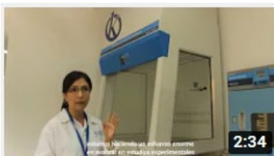
Kalstein France - Jacinto Convit Foundation / Alliances 23 views • 3 years ago