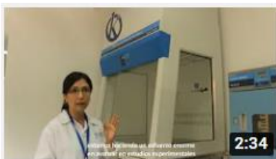
Kalstein France - Jacinto Convit Foundation / Allianc...