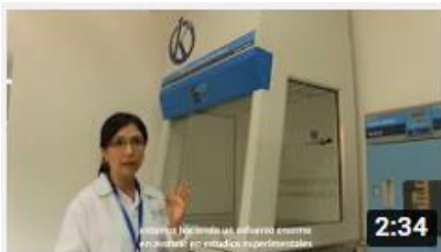
Kalstein France - Jacinto Convit Foundation / Allianc...