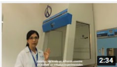
Kalstein France - Jacinto Convit Foundation / Alliances