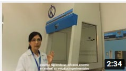
Kalstein France - Jacinto Convit Foundation / Alliances 23 views • 3 years ago