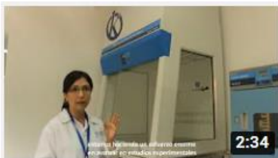
Kalstein France - Jacinto Convit Foundation / Allianc... 23 views • 3 years ago