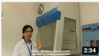
Kalstein France - Jacinto Convit Foundation / Alliances