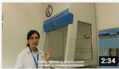
Kalstein France - Jacinto Convit Foundation / Allianc...