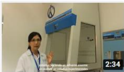
Kalstein France - Jacinto Convit Foundation / Alliances 23 views • 3 years ago