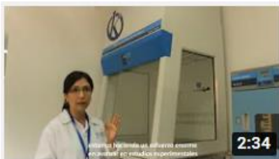
Kalstein France - Jacinto Convit Foundation / Allianc... 23 views • 3 years ago