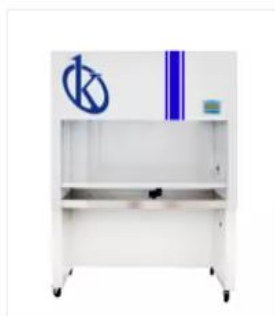
Laminar Flow Cabinet YR05746