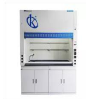
Laboratory Fume Hood, acid and alkali resistant