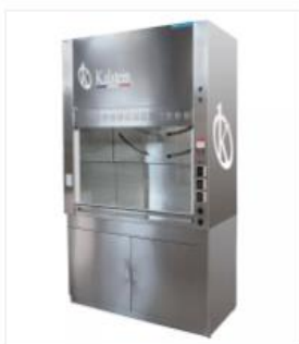
Stainless Steel Laboratory Fume Hood YR05E

Catalog of Biosafety Campaigns and Booths on offer