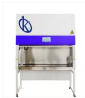
Biological Safety Cabinet 100% Exhaust Class