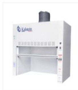
Epoxy-Coated Steel Basic Chemical Laboratory