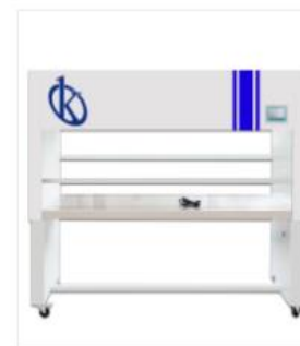
Laminar Flow Cabinet YR05743