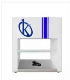
Horizontal Laminar Flow Cabinet YR05735