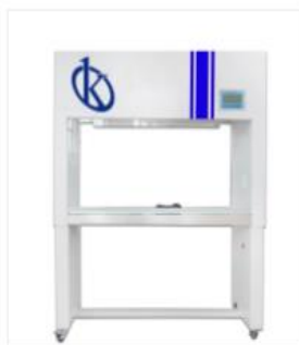
Laminar Flow Cabinet YR05737