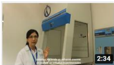
Kalstein France - Jacinto Convit Foundation / Allianc... 23 views • 3 years ago