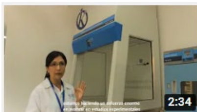
Kalstein France - Jacinto Convit Foundation / Alliances