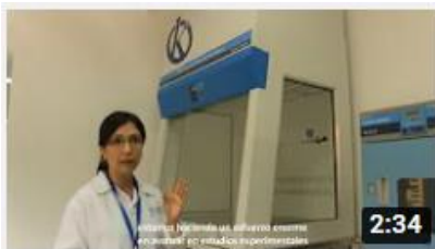
Kalstein France - Jacinto Convit Foundation / Alliances 23 views • 3 years ago